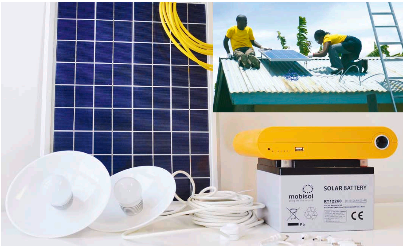
Solar Home Systems Kit with solar panel and equipment