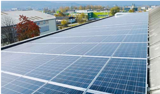
Photovoltaic solar panels