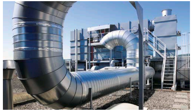
Regenerative Thermal Oxidation