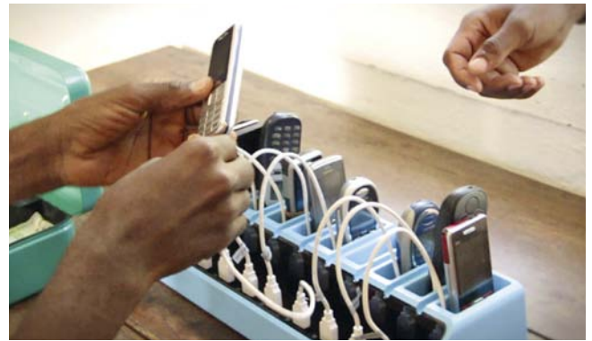
Charging device for mobile phones

and does not charge the customers for the installation of the SHS kit at all.