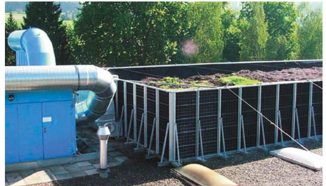
Biofilter plant on the factory roof