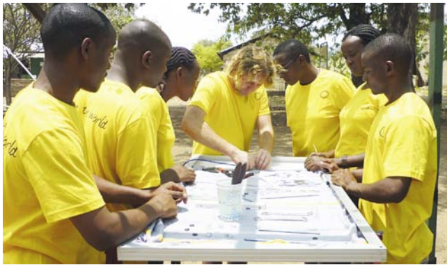
Mobisol educating local technicians